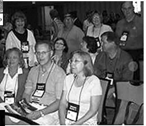
At a General Session